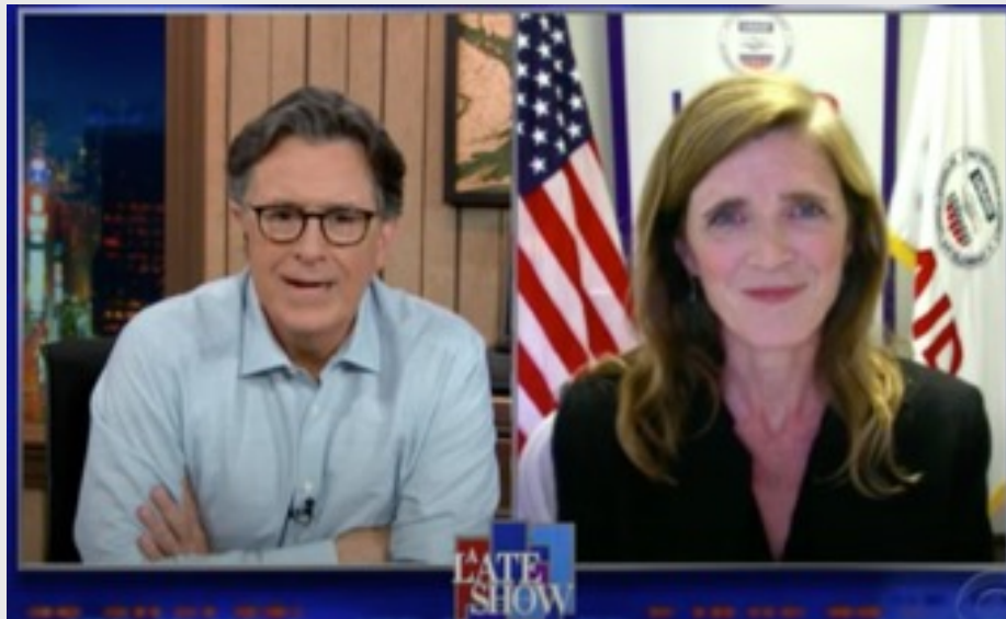
Stephen Colbert and Samantha Power

On June 10, 2021, USAID Administrator Samantha Power participated in a one-on-one interview with Stephen Colbert on his nighttime "A Late Show." Colbert asked questions to educate the audience about the role of the US Agency for International Development in the world. Power explained the global presence and breadth of focus of USAID's engagement, both in terms of development content and geography – "a soft power arsenal." She also discussed the "major" job for USAID in the $500 million vaccine doses to developing countries and the agency's role as the primary entity in exercising President Biden's "root causes strategy" in the Northern Triangle for the border issue. For you early-to-bed members who may have missed this late-night show, you can view the interview by clicking here .