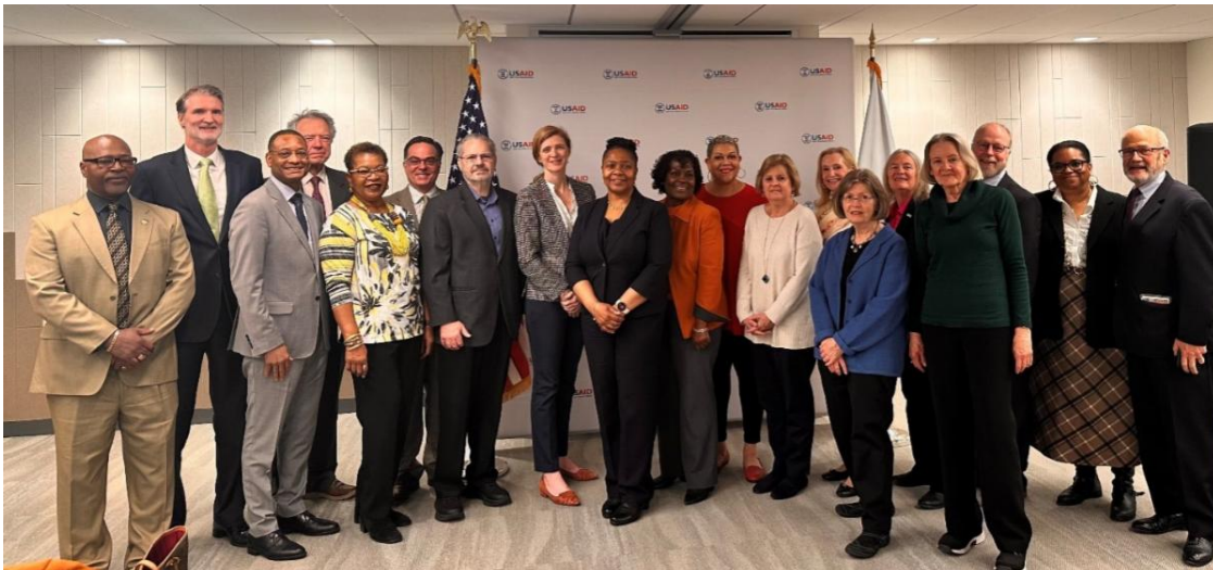
Administrator Power with a group of retirees, USAID staff and UAA officers

For the second year in a row, UAA helped USAID to organize and co-hosted an Annual Agency Retirement Ceremony on March 22, 2023 that was held both in-person at USAID HQ and virtually. One hundred FS and GS Retirees of 2022 were honored from all grades and ranks, including SFS/SES. This is the first time that such a broad array of Retirees has been honored in many years. Over 50 people attended the in-person Ceremony, including Retirees, their Guests, and Agency active-duty officers. Over 320 people joined the Ceremony virtually on-line from around the world.