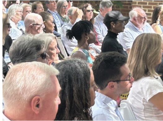
Spring reception participants

The 2026 Spring Reception was not only a celebration of decades-long friendships and past service but also an important step in beginning to consider how best to apply our values and mission in the future.